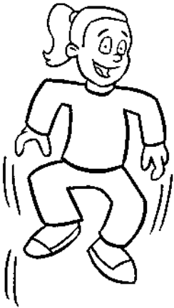
3 - I _____