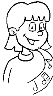
4 - _____