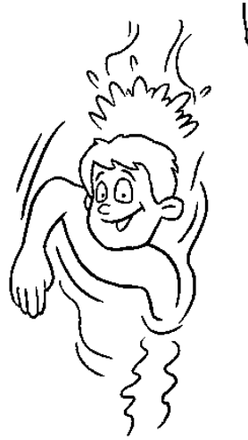
2 - I can _____.