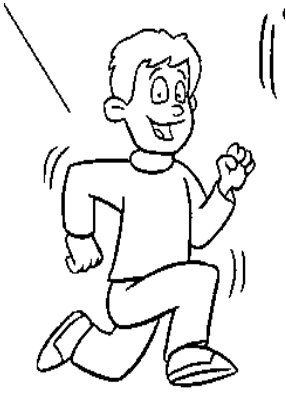
1 - I Can run.