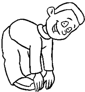
5 - _____ my _____.